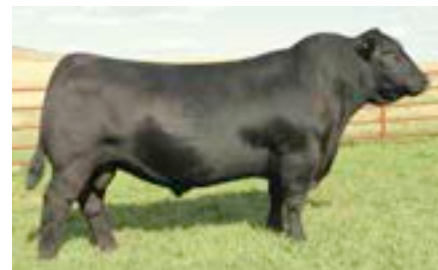
SAV Renown 3439

The dam of Bramblett Renown B773, Bramblett Momentum B215, was one of the first daughters of SAV Momentum 9274 born at Bramblett Angus. She is a daughter of Three Trees Barbara S0941 and a grand-daughter of the $90,000 pathfinder donor dam, Sitz Barbara Perfection 1882.