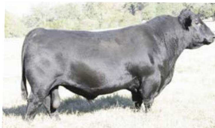
SAV Remainder 4840