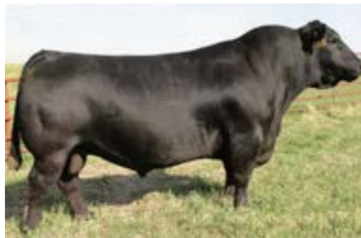
SAV Resource 1441