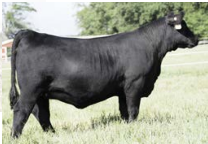
The flushmate sister of lots 13-16

The dam of these four flush brothers is the great SAV Net Worth 4200 daughter LB Hazel 1707, sold to Uncle Henry's of Graceville, FL at the Bramblett Angus Sale in 2015.