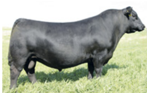
SAV Momentum 9274

The grandam of this bull, LB Miss Design 004, is a SAV 8180 Traveler 004 daughter and donor cow in the Bramblett Angus herd. Not a single daughter of this matron born at Bramblett Angus has been sold, all have been maintained for production. The most recent flush from LB Miss Design 004 was sold prior to the embryo removal date.